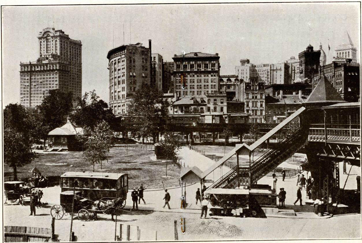
The above is an example of the quality of photographic reproductions such as will appear in the Special Art Book on Velostigmat Lenses. It is from a film negative made with a Series I Velostigmat F:6.3.