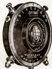
Series I F:6.3