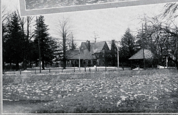
All the above photos made from same view-point with 8 x 10 Series Ia Velostigmat, top, 25½" front element; center, 20" back element; bottom 13" doublet.